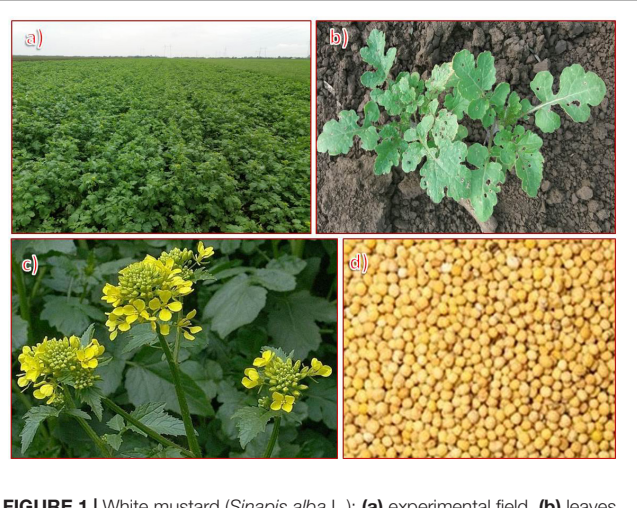
FIGURE 1 | White mustard ( Sinapis alba L.): (a) experimental field, (b) leaves, (c) flowers, and (d) seeds.

White mustard is an annual, broad-leaved, yellow-flowered, coolseason plant from the Brassicaceae family, that grows up to 100 cm high, with a relatively short growing season of about 85–95 days ( Figure 1 ). The flowers, which bloom from May to June, are yellow with four petals. Mustard tolerates drought and heat, so it is well suited to production in drier soil zones. It is typically grown in rotation with cereal crops for its young leaves, seeds, or green manure. The use of white mustard in crop rotations is desirable due to its effect on residue conditions in the field, soil moisture conditions, and disease, weed, and insect problems. Ideally, white mustard is grown after a cereal crop. Mustard is commonly grown on summer fallow or stubble in dry and moist areas, respectively. Varietal selection involves various factors, including expected price, yield potential, and agronomic characteristics.