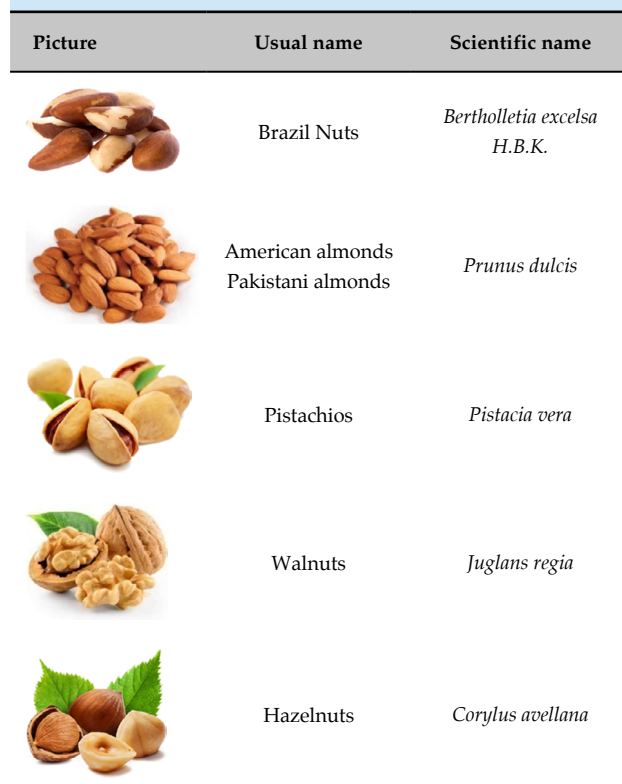
Table 1 - Nuts

Damasceno et al., 12 evaluated three types of diets in hypercholesterolemic subjects - a diet enriched with virgin olive oil (35 to 50 g daily), almonds (50 to 75 g daily) or walnuts (40 to 65 g daily) for four weeks. The amounts of each nutrient were calculated according to total energy intake. Among the three diets, almond-enriched diet