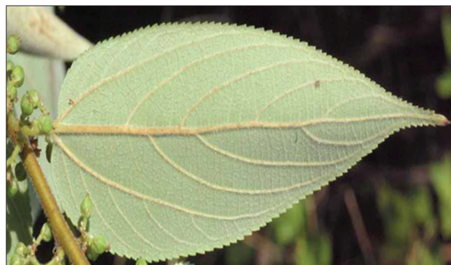
Figure 1b: Underside of a single leaf of Trema orientalis

The fruits and flowers are used to prepare infusion that are administered to children as a therapy for bronchitis, pneumonia and pleurisy. [16,17]