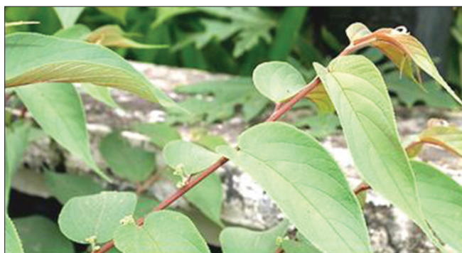
Figure 1a: Trema orientalis leaves

The flowers are small, inconspicuous, and greenish, carried in short dense bunches. They are usually unisexual, occasionally they are bisexual. Flowers appear irregularly from late February to April. [8] The fruits are small, round, and dark purple or green drupes that become black when ripe, and they are carried on very short stalks. [7] The onset