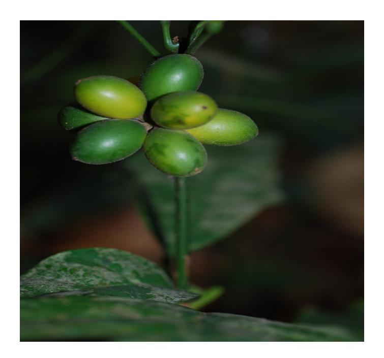
Figure 2. Sphenocentrum jollyanum fruits.