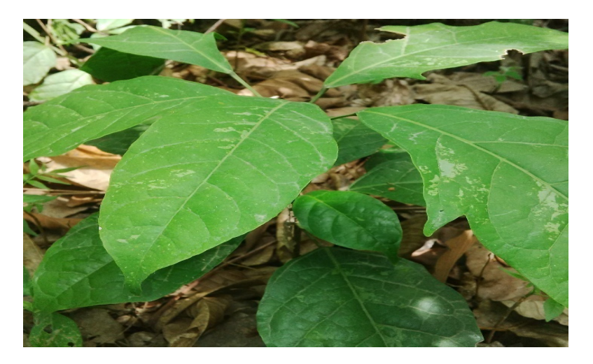
Figure 1. Sphenocentrum jollyanum in its natural habitat.

Sphenocentrum jollyanum (Figure 1) is a perennial under growth of dense forest, which thrives in deep shade, from sea-level up to 400 m altitude. It is mostly found in regions withmean annual rainfall of 1800 mm or more, mean minimum temperature of 20 °C, and mean maximum of 29 °C. It grows to an average height of about 1.5 m, with few scanty branches. S. jollyanum leaves are wedge-shaped, about 5–12 cm wide, smooth onboth sides, and can grow up to about 20 cm long with a small-arrowed apex [6,7]. The fruit (Figure 2) occurs as clusters, ovoid-ellipsoid, with a single large oval-shaped seed. It is fleshy, edible, and bright yellow or orange when ripe [8,9]. The roots are visibly bright yellow and are characterized by a sour acidic taste that causes things eaten thereafter to taste sweet [8].