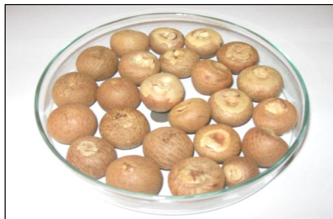
FIG.2: LABORATORY SAMPLE OF ARECA CATECHU