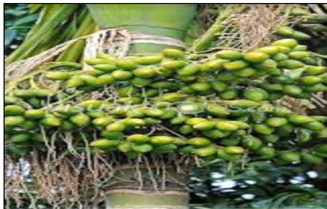
FIG.1: ARECA CATECHU: