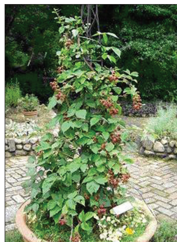
Figure 1: Plant of R. fruticosus

Blackberry, also known as European blackberry.