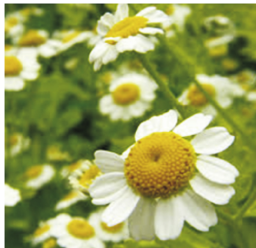
Figure 7. Anthemis nobilis Linn.

Its antianxiety, stress relieving properties ease out depression, worry, and overactive mind. Its use before sleep for bath can relax both mind and body and brings on sleep, with a peaceful