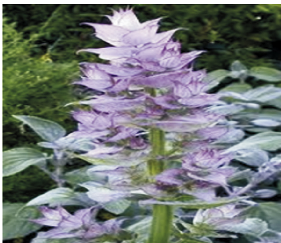
Figure 1. Salvia sclarea Linn.

Eucalyptus [ Eucalyptus globulus Labill ( E. globulus )] belonging to the family of Myrtaceae, is a long evergreen plant with a height up to 250 feet (Figure 2). It is known for its