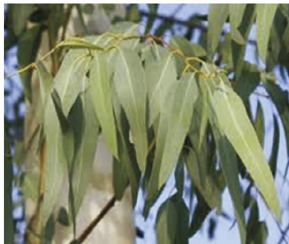
Figure 2. E. globulus Labill.

constituents like cineole (70%–85%), aromadendrene limonene terpinene, cymene, phellandrene, and pinene [38,43]. Its oils have been used to regulate and activate the various systems like nervous system for neuralgia, headache and debility. The immune system boosts the immunity against measles, flu, cold and chickenpox. Leucorrhea and cystitis of genitourinary system can also be well treated with it. Throat infections, catarrh, coughs, bronchitis, asthma and sinusitis associated with respiratory system have been taken care of by oils of this plant. Moreover, skin problems like wounds, cuts, burns, herpes, lice, insect repellent and insect bites can be treated with it. Treatment of rheumatoid arthritis, muscle and joint pains and aches is well reported from the essential oils of this plant [36,44,45]. Eucalyptus oil has demonstrated its antioxidant, anti-inflammatory, anti-proliferative and antibacterial activities and researchers have proved its efficacy beyond doubt in treatment of various metabolic and infectious diseases. The results are promising and can be utilized for treatment of multifactorial diseases of various origins in humans [44,46].