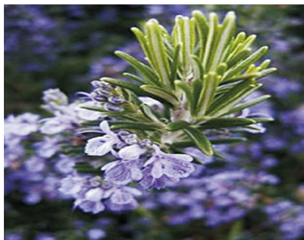
Figure 8. Rosmarinus officinalis Linn.

Rosemary ( Rosmarinus officinalis Linn.) belonging to the family of Lamiaceae bears small pale blue flowers in late spring/early summer and grows up to the height of 90 cm (Figure 8). It has three varieties (silver, gold and green stripe); it's the green variety that is used for its medicinal properties. This plant is rich in bitter principle, resin, tannic acid and volatile oil. The active constituents are bornyl acetate, borneol along with other esters and, special camphor similar to that possessed by the myrtle, cineol, pinene and camphene [40]. Its oil has a marked action on the digestive system, with relieving the symptoms of indigestion, constipation and colitis. It works as liver and gall-bladder tonic. The oil also possesses some good action on the cardiovascular system. It regularizes the blood pressure and retards the hardening of arteries. In winter, it used to relieve the