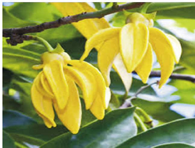
Figure 10. Cananga odorata Hook. F. & Thoms.

farnesol, benzyl acetate, geranial, methyl chavicol, beta-caryophyllene, eugenol, pinene and farnesene. The best property of this tree is to retard the heart beat and rapid breathing with perfect use in shock and trauma situations. It is anti-depressive in nature with euphoric properties [5], thus giving the feeling of well being. Low self-esteem and women suffering from the post-menopausal syndrome have better results on them. A pilot study involving 34 professionals from a nursing group was carried out in Portugal to verify the use of ylang ylang essential oil in relieving the anxiety and increasing the self esteem along with alteration of blood pressure and temperature. The results showed clear evidence that use of this plant led to a significant alteration in self esteem [74]. Further, its aphrodisiac properties are due to its exotic fragrance advantageous for both dry and oily skins. It is also indicated in depression, anxiety, hypertension, frigidity, stress and palpitations [75].