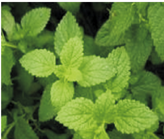
Figure 6. M. piperita Linn.

primary constituent of peppermint oil. At least 44% free menthol is present in peppermint oil. Components are sensitive to climate, latitude and maturity of the plant. Inhalation and application of menthol on skin causes a skin reaction. It is used in many liniments dosage form to relieve pain spasms and arthritic problems. Peppermint oil is studied and documented for its antiinflammatory, analgesic, anti-infectious, antimicrobial, antiseptic, antispasmodic, astringent, digestive, carminative, fungicidal effects, nerve stimulant, vasoconstrictor, decongestant and stomachic properties.