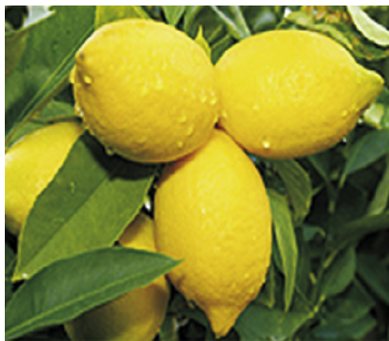
Figure 5. C. limon Linn.

Peppermint [ Mentha piperita Linn. ( M. piperita )] belongs to the family of Lamiaceae (Figure 6). Till date, all the 600 kinds of mints are raised from 25 well-defined species. The two most important are peppermint ( M. piperita ) and spearmint ( Mentha spicata ). Spearmint bears the strong aroma of sweet character with a sharp menthol undertone. Its oil constituents include carvacrol, menthol, carvone, methyl acetate, limonene and menthone. The pharmacological action is due to menthol, a