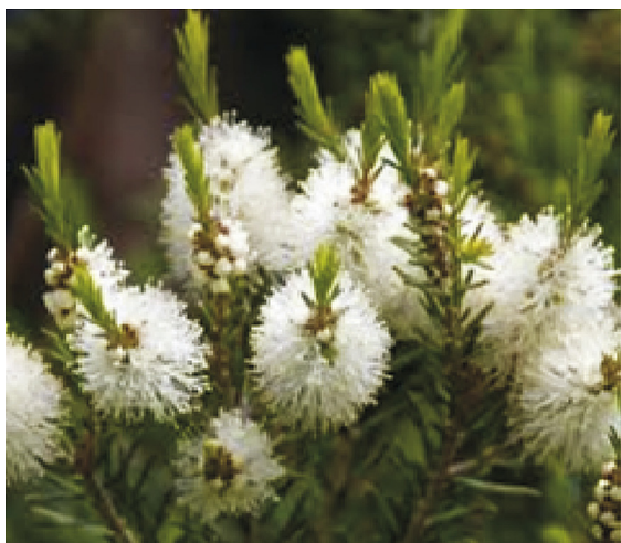
Figure 9. Melaleuca alternifolia Cheel.

Ylang-ylang ( Cananga odorata Hook. F. & Thoms) belonging to the family of Annonaceae, native to Madagascar, Indonesia and Philippines is a small tree (Figure 10). Its chemical constituent includes geranyl acetate, linalol, geraniol,