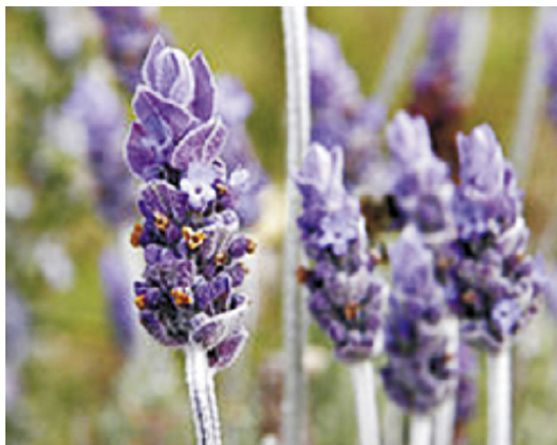
Figure 4. Lavandula officinalis Chaix.

Lavender ( Lavandula officinalis Chaix.) belonging to the family of Lamiaceae, is a beautiful herb of the garden (Figure 4). It contains camphor, terpinen-4-ol, linalool, linalyl acetate, beta-cimene and 1,8-cineole [38]. Its constituent varies in concentration and therapeutic effects with the different species. Linalool and linalyl acetate have maximum and great absorbing properties from skin during massage with a depression of central nervous system. Linalool shows sedative effects and linalyl acetate shows marked narcotic actions. These two actions may be responsible for its use in lavender pillow anxiety patients with sleep disturbance pattern, improving the feeling of well being, supporting mental alertness and suppressing aggression and anxiety [53]. Lavender oil shows its antibacterial and antifungal properties against many species of bacteria, especially when antibiotics fail to work, but the exact mechanisms are yet to be established. When talking about its use in aromatherapy, it is