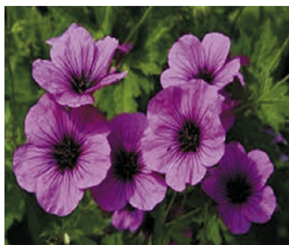
Figure 3. Pelargonium graveolens L' Herit.

Geranium ( Pelargonium graveolens L' Herit) belongs to the family of Geraniaceae (Figure 3). A perennial hairy shrub native