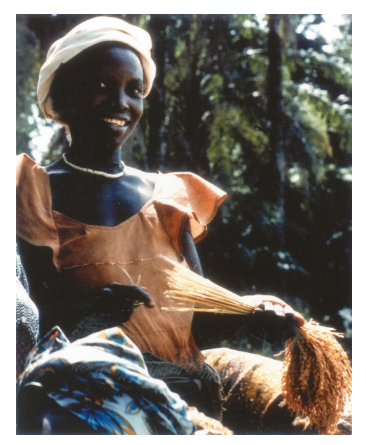
Fig. 5. Displaying the rice seed for exchange.