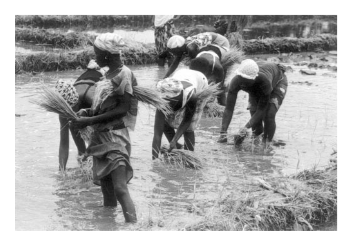
Fig. 3. Jola women transplant the rice seedlings.

The Jola practice a labor-intensive form of wet-rice cultivation. They till the soil, and dike and bund the paddy fields using a unique fulcrum shovel known as the kajandu (Fig. 2). The Jola use sophisticated methods of rainwater control and distribution, keep the tidal waters out of their rice fields and construct fish ponds, apply abundant amounts of cattle dung for fertilizer, transplant seedlings from prepared nurseries into flooded fields (Fig. 3), weed the crop, and harvest the rice panicles individually (16) (Fig. 4). Important regional differences exist in the gender division of labor, the dominance of upland versus floodplain cultivation, the ratio of transplanted to direct-seeded rice, and the role played by secondary and commercial crops. But everywhere in the Jola area, rice is the dominant subsistence crop. It is grown all over the countryside, in tidal zones recovered from the mangrove vegetation, inland freshwater valleys, and low plateaus. It is also cultivated in peri-urban zones around secondary cities such as Ziguinchor, the capital of the Casamance, and Bignona, a town north of the Casamance River.