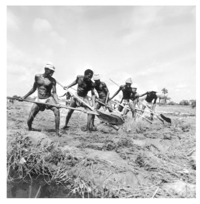
Fig. 2. Men prepare the rice fields using the kajandu.

The Jola practice a labor-intensive form of wet-rice cultivation. They till the soil, and dike and bund the paddy fields using a unique fulcrum shovel known as the kajandu (Fig. 2). The Jola use sophisticated methods of rainwater control and distribution, keep the tidal waters out of their rice fields and construct fish ponds, apply abundant amounts of cattle dung for fertilizer, transplant seedlings from prepared nurseries into flooded fields (Fig. 3), weed the crop, and harvest the rice panicles individually (16) (Fig. 4). Important regional differences exist in the gender division of labor, the dominance of upland versus floodplain cultivation, the ratio of transplanted to direct-seeded rice, and the role played by secondary and commercial crops. But everywhere in the Jola area, rice is the dominant subsistence crop. It is grown all over the countryside, in tidal zones recovered from the mangrove vegetation, inland freshwater valleys, and low plateaus. It is also cultivated in peri-urban zones around secondary cities such as Ziguinchor, the capital of the Casamance, and Bignona, a town north of the Casamance River.