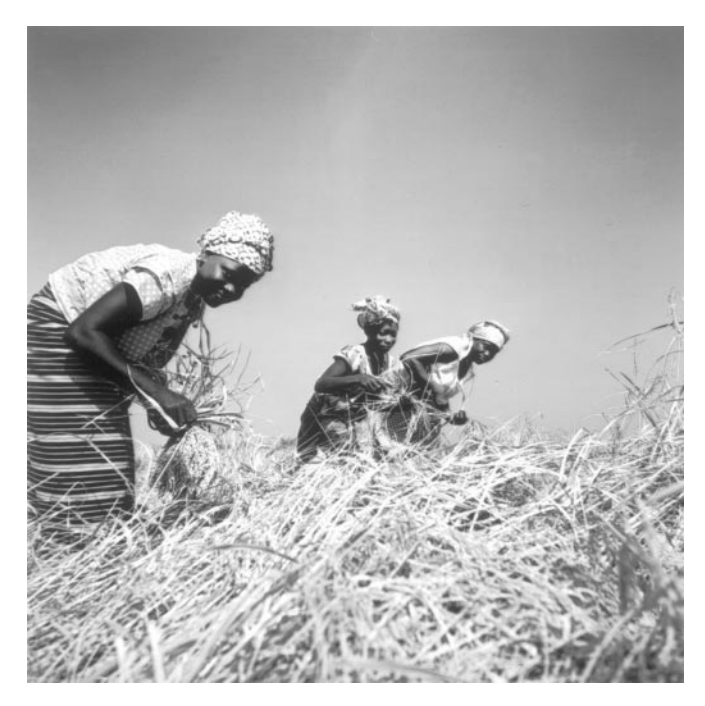
Fig. 4. Young women harvesting rice.

In 1965, as part of an ongoing project on Jola rice cultivation practices, I collected all of the rice varieties grown in a small village of \approx 600 people known as Jipalom. Located in the mixed rice and groundnut growing area north of the river, away from the most intensive zone south of the river where rice is cultivated as a monocrop, the inhabitants of the Jipalom community still planted several varieties of the African O. glaberrima species. The rice samples collected were then identified in 1966 by R. Portères, the renowned rice expert, who divided the sample into the two species and named their various subspecies and types. The results of his identifications are presented in the following outline.