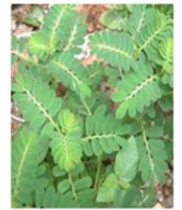
Fig 1. Phyllanthus amarus Schum. & Thonn.

Phyllanthus amarus is a herb that grows upto 10-60 cms tall, erect, stem terete, younger parts rough, cataphylls 1.5-1.9 mm long, deltoid acuminate; leaf 3.0-11.0 \times 1.5-6.0 \text{ mm} , elliptic oblong to obvate, obtuse or minutely apiculate at apex, obtuse or slightly inequilateral at base; Flowers axillary, proximal 2-3 axils with unisexual 1-3 male flowers and all succeeding axils with bisexual cymules. Male flowers -pedicel 1mm long, calyx 5, sub equal 0.7 \times 0.3 \text{ mm} , oblong, elliptic, apex acute, hyaline with unbranched mid rib; disc segments 5, rounded, stamens 3, filaments connate. Female flowers-pedicel 0.8-1.0 mm long, calyx lobes 5, 0.6 \times 0.25 \text{ mm} , ovate-oblong, acute at apex; disc flat deeply 5 lobed, lobes often toothed at apex, styles 3, free, shallowly bifid at apex. Capsule 1.8 mm in diameter, oblate and rounded, seeds about 0.9 mm long, triangular with 6-7 longitudinal ribs and many transverse striations on the back.