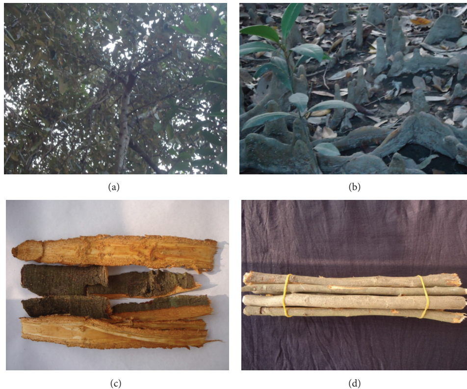
FIGURE 1: Various parts of Heritiera fomes . Clockwise from top left: tree, pneumatophores, twigs, and barks.

screen compounds. Substances in mangroves have long been used in folk medicines to treat diseases [4]. Extracts of various parts of mangrove plants have significant activity against animal, human, and plant viruses including human immunodeficiency virus [5].