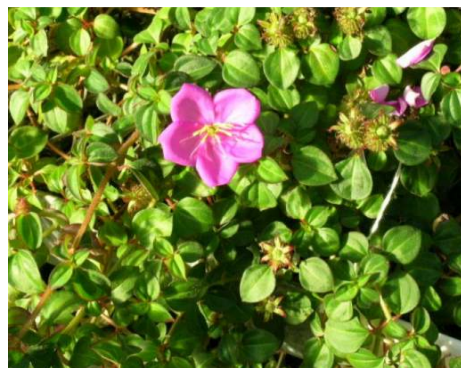
Fig. 1. The leaves and flowers of Dissotis rotundifolia (Adapted from plant breeding in the 21 st century – University of Georgia)

Dissotis rotundifolia belongs to the Kingdom Plantae, the subkingdom Tracheobionta and the super division of Spermatophyta. It is in the division Magnoliophyta and belongs to the class Magnoliopsida. It is classified under the subclass Rosidae and the order Myrtales. It belongs to the family melastomataceae, the genus Dissotis and the species is rotundifolia (Fig. 1).